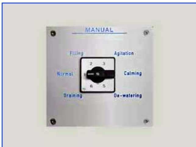
Manual control panel